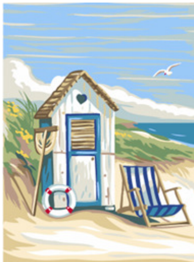
9880131-00156 Beach 22x30cm White Canvas Sheet 2