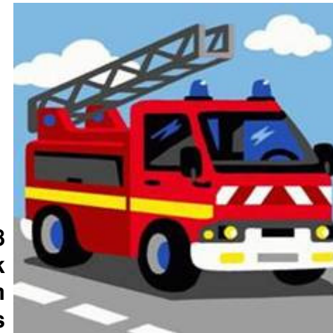
9886035-00138 Fireman Truck 19x19cm Sudan Canvas