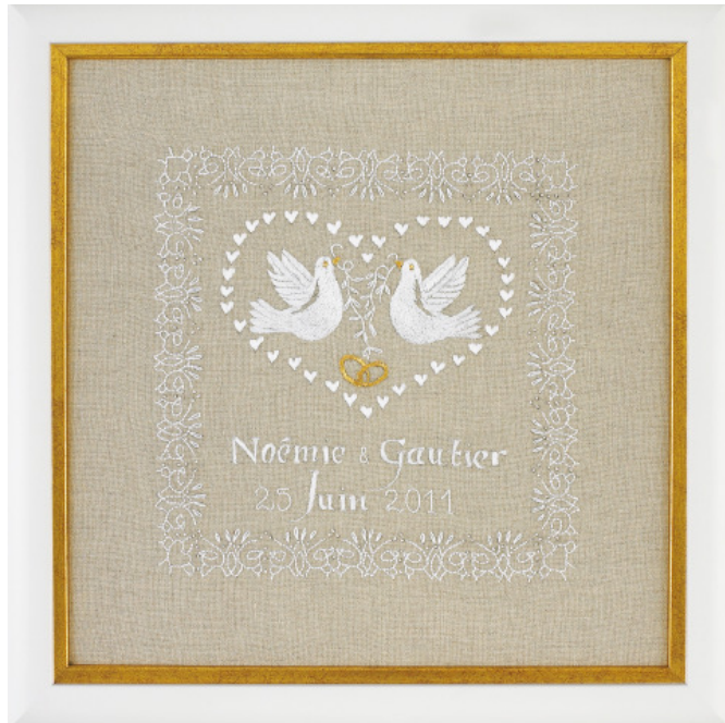
9886477-00015 Wedding 22.5x22.5cm Linen