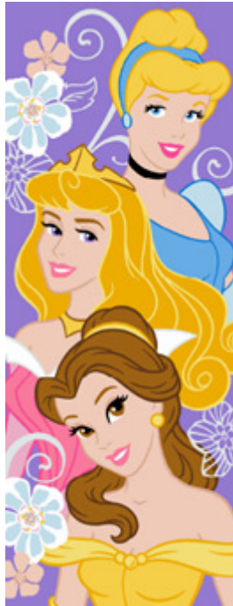
9880133-00121 Princesses 19x49cm White Canvas Sheet 2