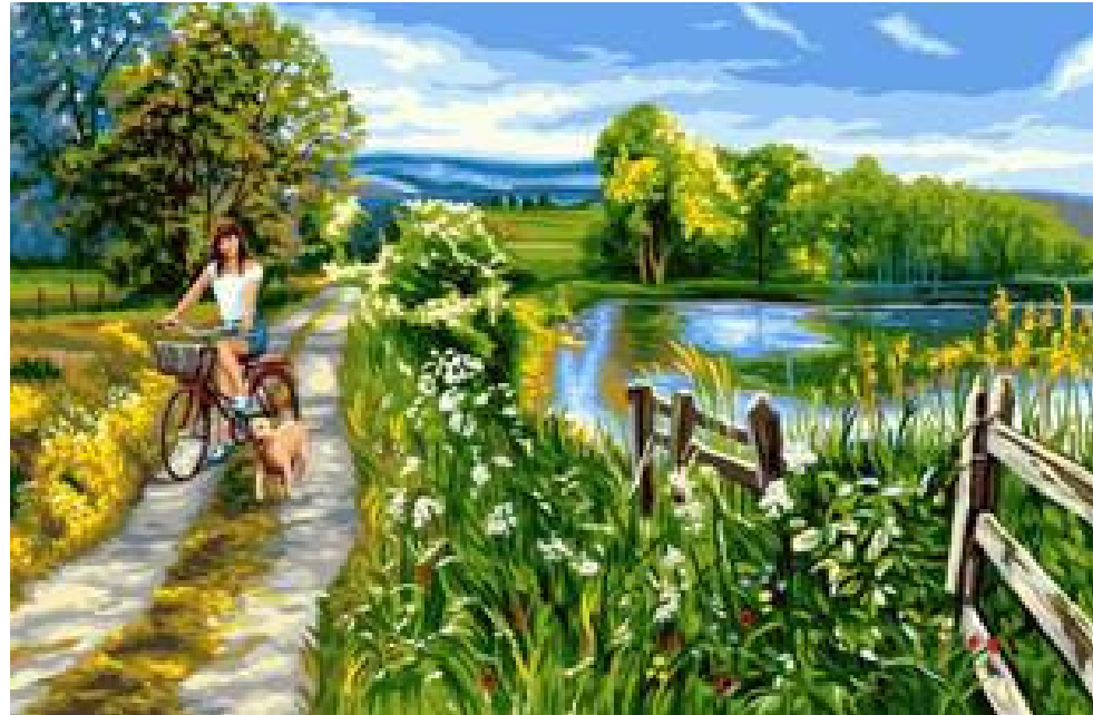
9880146-00080 The Lake 48x75cm Antique Canvas