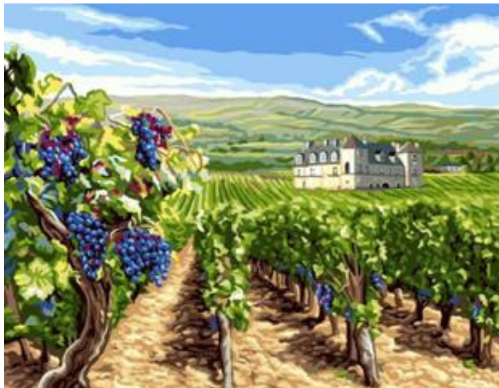
9880132-00193 Vineyard 37x47.5cm White Canvas