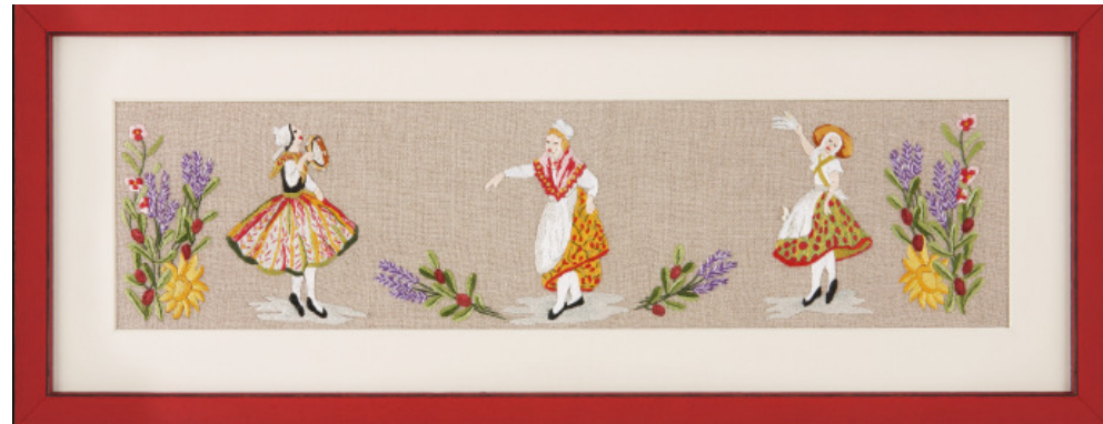
9886478-00002 Provencal Dancers Printed on Linen 10x43cm