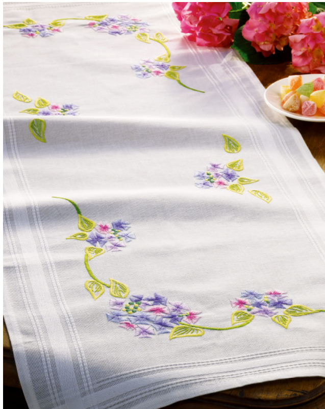
9886351-01762 Hydrangea Runner 40x100cm 100% cotton fabric with edging