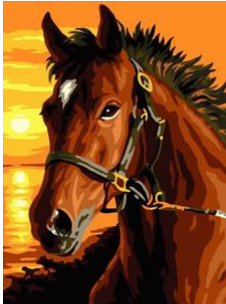
9886106-00090 Horse 15x20cm White Canvas