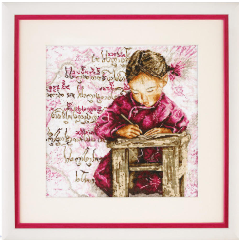
9886416-00011 Little Pupil 28x28cm 72/18# white Aida