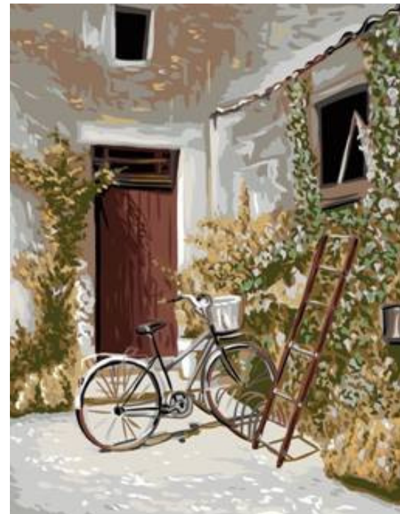
9880132-00192 Bike 37x47.5cm White Canvas