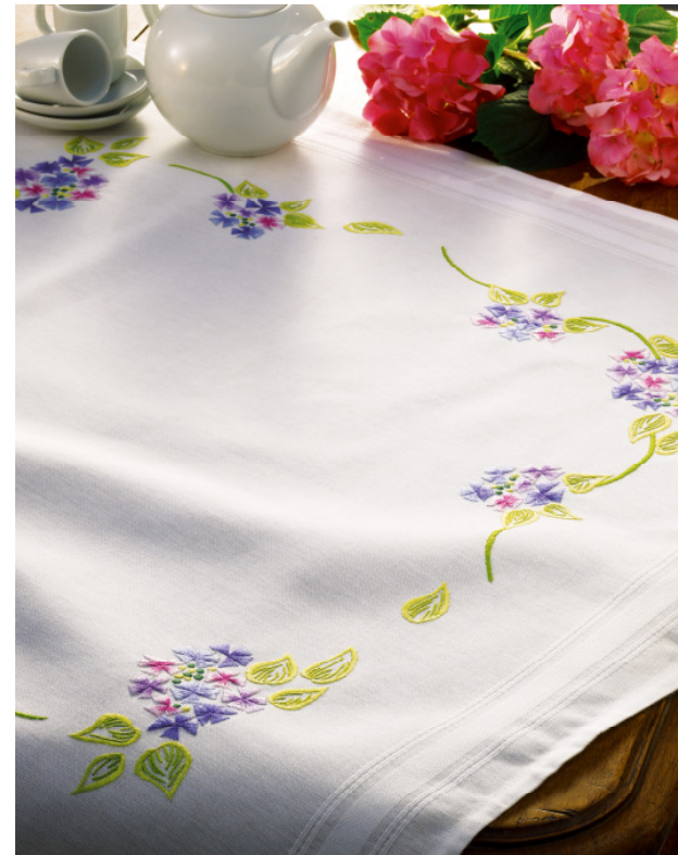
9886301-01762 Hydrangea Tablecloth 80x80cm 100% cotton fabric with edging