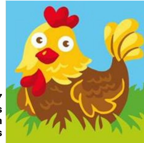
9886035-00137 Hens 19x19cm Sudan Canvas