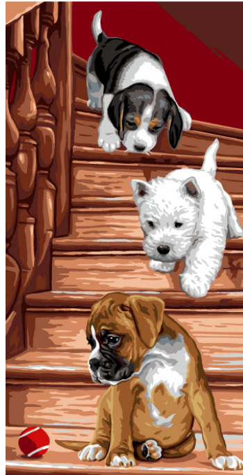
9880138-00006 Puppy 53x27cm Antique Canvas