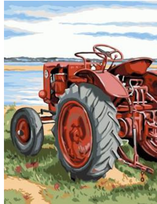
9880142-00518 Red Tractor 37x47.5cm Antique Canvas