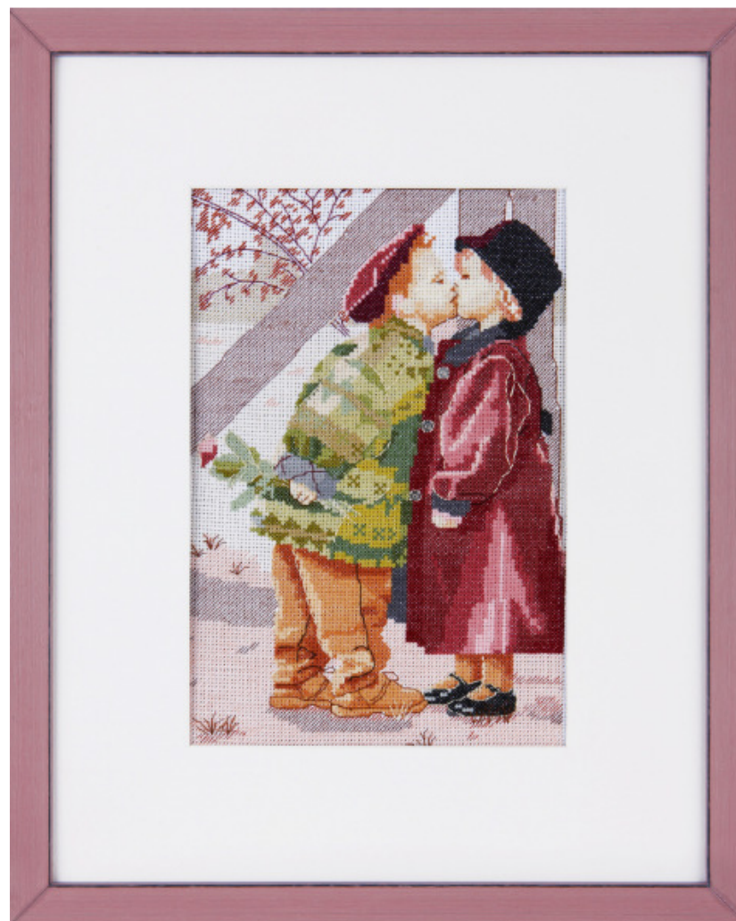
9886437-00039 Engaged 28.5x18cm 55/14# white Aida